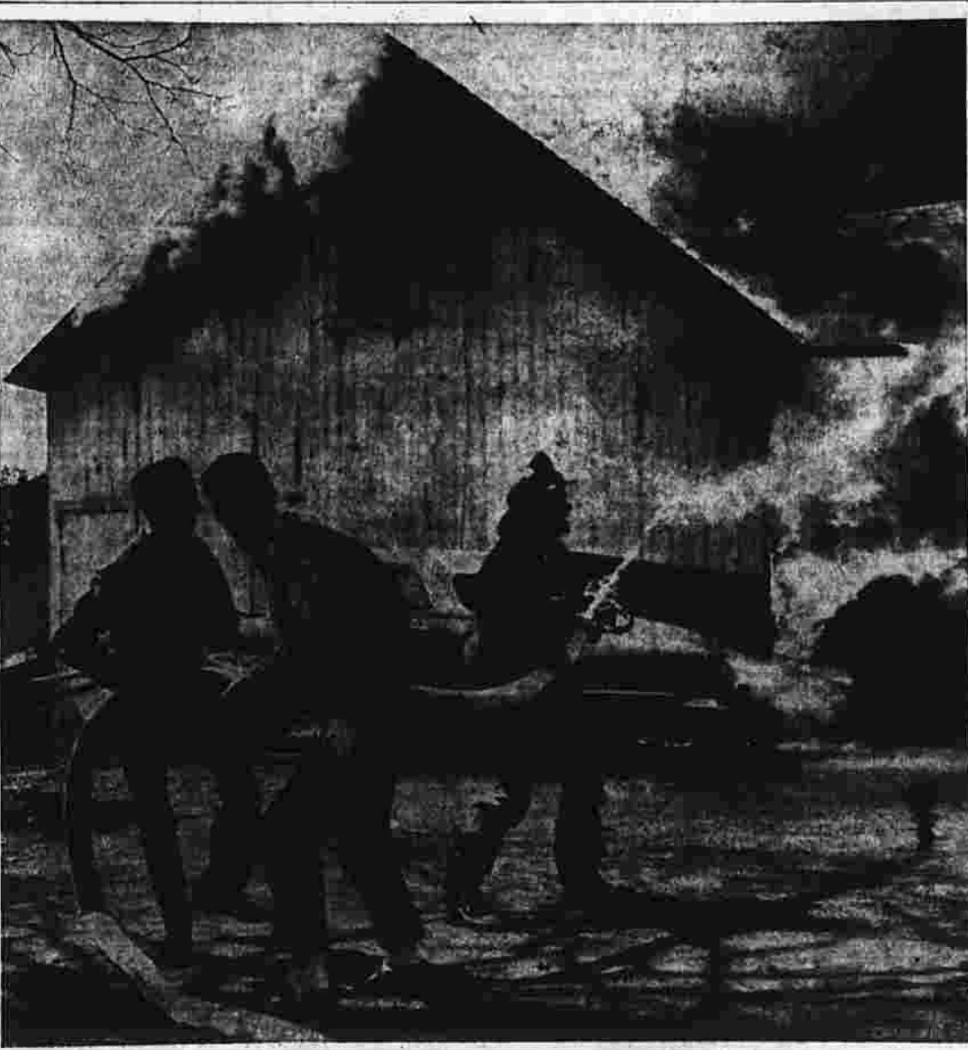
Hot Time for Hot Rods A Town of Manchester fireman aims a stream of water at a blazing carriage house on Hartford Rd., opposite Palm St., in which two hot rod cars and the frame of another were destroyed late this morning.

Norwalk, April 17 (AP)—A spectacular early-morning fire of undetermined origin destroyed a large department store on Route 7 here today. One fireman was treated at Norwalk Hospital for smoke inhalation and released.