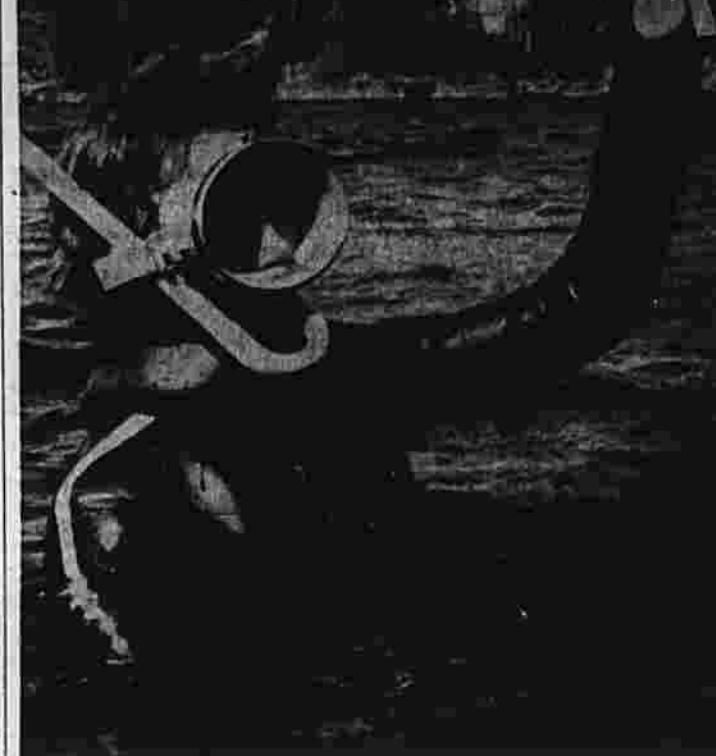
Gloria Wutach of 98 Ridge St. (or at least that's what we think she's doing) as she plucks the first egg from Coventry Lake in the most novel of 'Easter egg hunts—an underwater contest.

And on Some of Manchester's Side Streets, Too