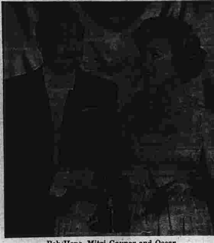
Bob Hope, Mitzi Gaynor and Oscar